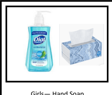
Girls - Hand Soap