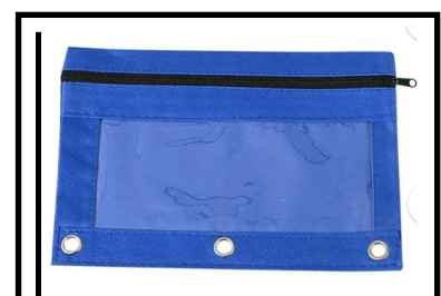
Large-sized, Zipper Pencil Pouch